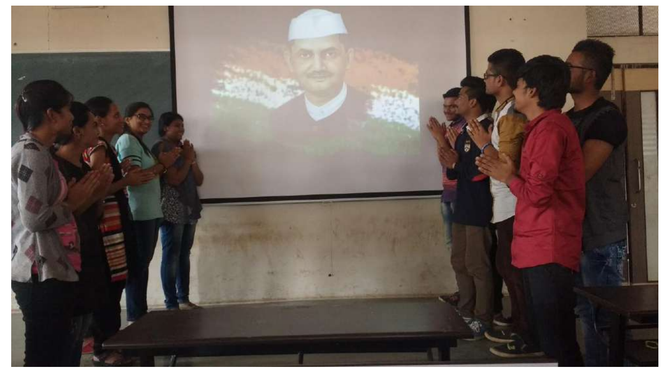
Celebration of Lal Bahadur Shastri Jayanti